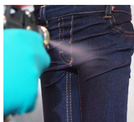
treatment with PERISTAL BLI